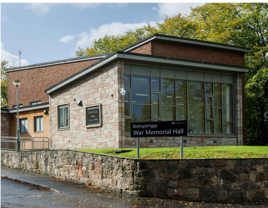
The AGM takes place in Bishopbriggs War Memorial Hall on Thursday 12 th October